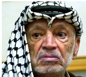
Yasser Arafat *